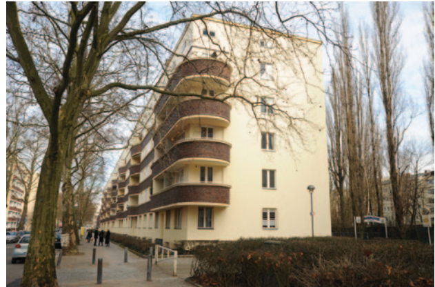
One of the properties in the Puma Brandenburg Finance portfolio

The Directors consider that the report and accounts, taken as a whole, is fair, balanced and understandable and provides the information necessary for shareholders to assess the Company's performance, business model and strategy.