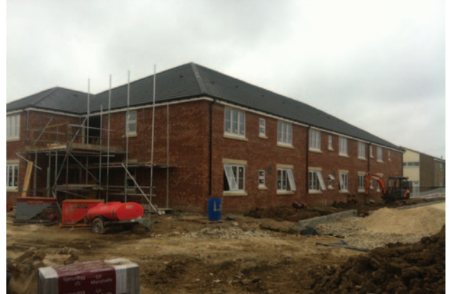
Development at Crosland Road, Grimsby