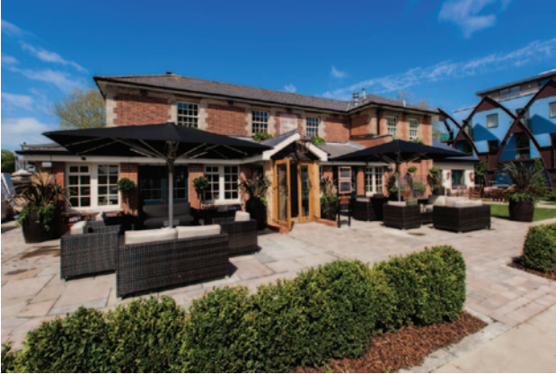
The newly opened Brewhouse & Kitchen unit in Dorchester